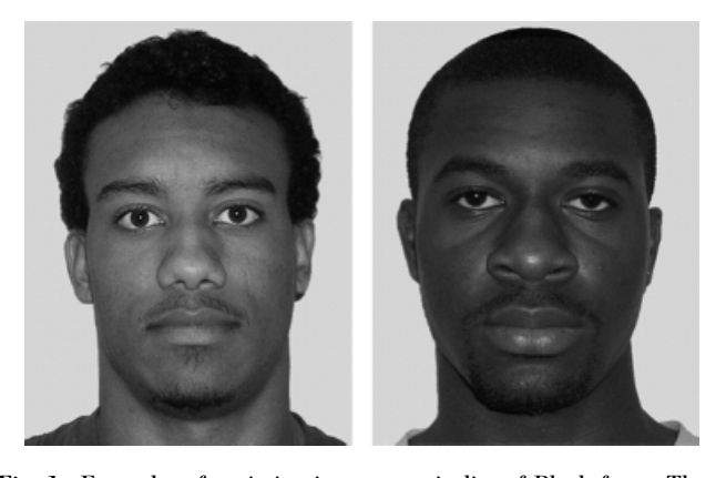
Fig. 1. Examples of variation in stereotypicality of Black faces. These images are the faces of people with no criminal history and are shown here for illustrative purposes only. The face on the right would be considered more stereotypically Black than the face on the left.

phia, Pennsylvania, that advanced to penalty phase between 1979 and 1999. Forty-four of these cases involved Black male defendants who were convicted of murdering White victims. We obtained the photographs of these Black defendants and presented all 44 of them (in a slide-show format) to naive raters who did not know that the photographs depicted convicted murderers. Raters were asked to rate the stereotypicality of each Black defendant's appearance and were told they could use any number of features (e.g., lips, nose, hair texture, skin tone) to arrive at their judgments (Fig. 1).